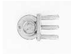
Station Key x 1