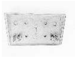
Mounting Bracket x 1